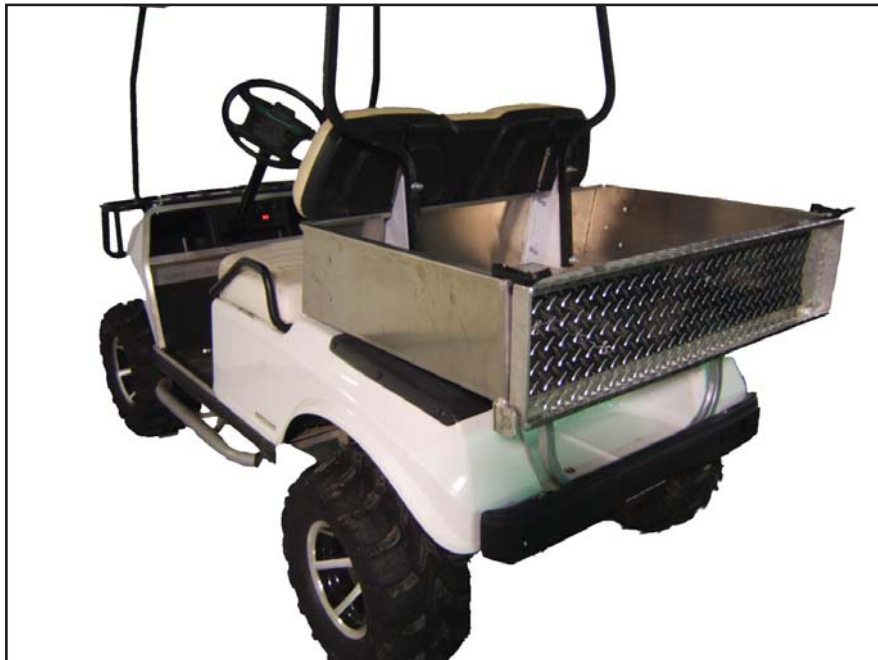
2000.5 & Up Mounting Shown